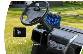
Adjustable steering column