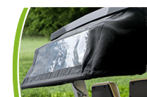
Golf bag cover with retractable mechanism