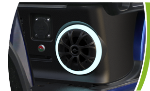
Stereo system with lights