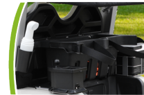
Golf bag holder and storage basket