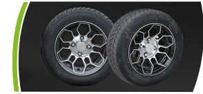
12" Aluminum wheel 205/50R12