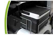
Caddy master cooler