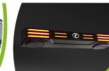
Cuboid sound bar