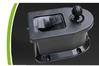
Golf ball washer