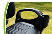
Rear armrest with built-in storage compartment