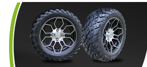
14" Aluminum wheel/ 23x10-14 silent tire with off-road