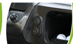
USB charging port