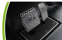
Accelerator / brake pedal