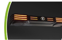
Cuboid sound bar