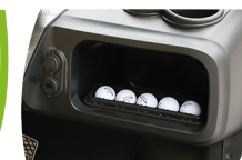
Storage compartment with golf ball & tee holder