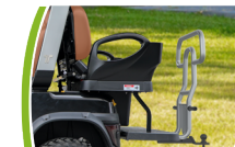
Rear handrail (Optional golf bag holder kit)