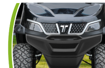
Led brake lights and turning signals