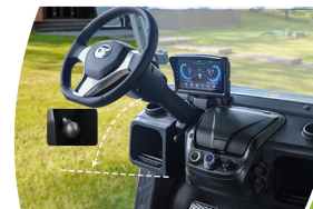
Adjustable steering column