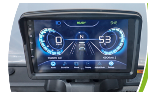
9" Touchscreen with carplay integration